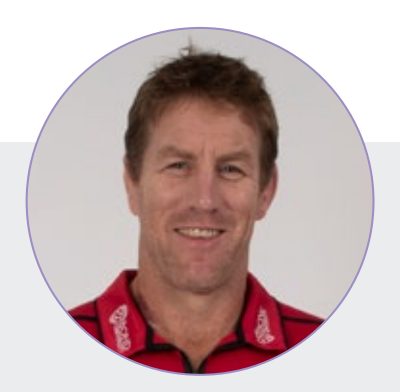
Brad Thorn QLD Reds Headcoach Rugby World Cup Winner Super Rugby Winner European Cup Winner Three NRL Premierships Two State of Origin titles